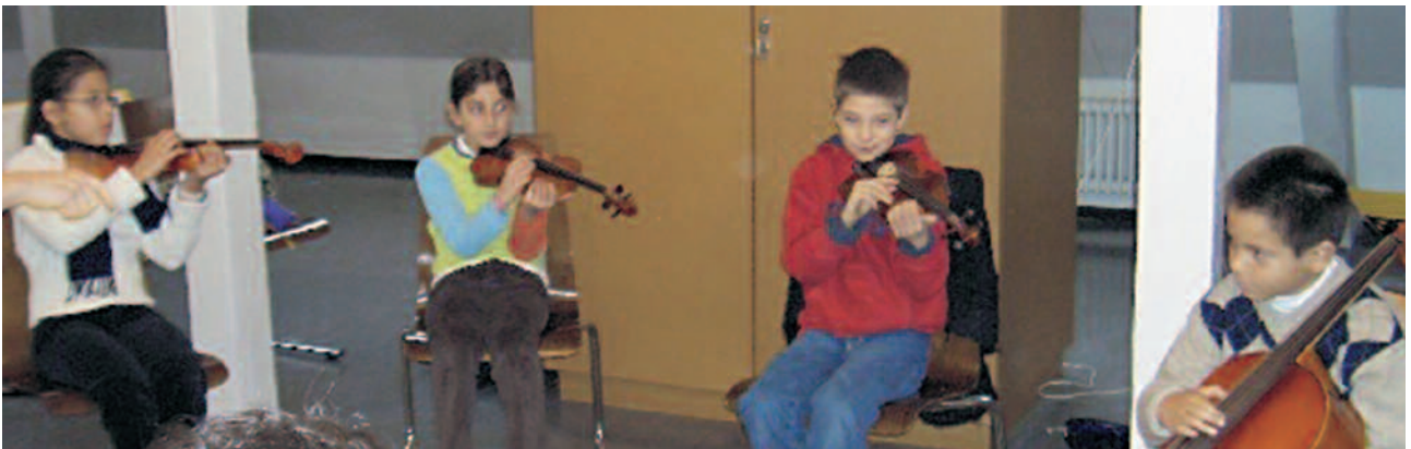
Children in the Florimont Institute School in Geneva trying string instruments the first time in their lives!